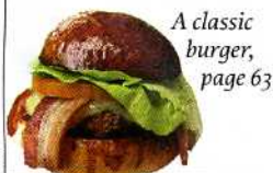
A classic burger, page 63