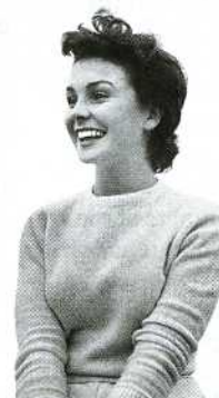
Jean Simmons, star of epics, page 18

56 | ESSAY Nancy Gibbs, facing a big milestone, reflects on what birthdays really mean