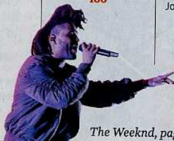
The Weeknd, page 112

9 Questions with comedian Mindy Kaling 120