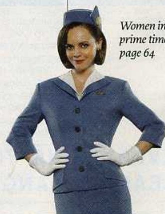
Women in prime time, page 64

68 | 10 Questions Jeopardy! champ and author Ken Jennings