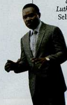
David Oyelowo as Martin Luther King Jr. in Selma , page 52

Joel Stein tries out hosting America's Funniest Home Videos