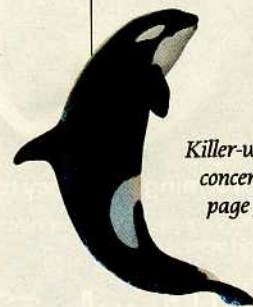
Killer-whale concerns, page 50

TIME (ISSN 0040-781X) is published weekly, except for two issues combined for one week in January, May, July and August, by Time Inc. Principal Office: Time & Life Building, Rockefeller Center, New York, NY 10020-1393. Periodicals postage paid at New York, N.Y., and at additional mailing offices. Canada Post Publications Mail Agreement No. 40110178. Return undeliverable Canada addresses to: Postal Stn A, P.O. Box 4322, Toronto, Ont., M5W 3G9. GST #888381621RT0001 © 2013 Time Inc. All rights reserved. Reproduction in whole or in part without written permission is prohibited. TIME and the Red Border Design are protected through trademark registration in the United States and in the foreign countries where TIME magazine circulates. U.S. subscriptions: $49 for one year. Subscribers: If the Postal Service alerts us that your magazine is undeliverable, we have no further obligation unless we receive a corrected address within two years. Postmaster: Send address changes to P.O. Box 62120, Tampa, FL 33662-2120. CUSTOMER SERVICE AND SUBSCRIPTIONS—For 24/7 service, please use our website: www.time.com/customer-service . You can also call 1-800-843-TIME or write to TIME, P.O. Box 62120, Tampa, FL 33662-2120. Mailing list: We make a portion of our mailing list available to reputable firms. If you would prefer that we not include your name, please call, or write us at P.O. Box 62120, Tampa, FL 33662-2120, or send us an e-mail at privacy@time.customersvc.com . Printed in the U.S.