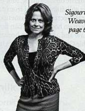
Sigourney Weaver, page 64

TIME (ISSN 0040-781X) is published weekly, except for two issues combined at year-end, by Time Inc. Principal Office: Time & Life Building, Rockefeller Center, New York, NY 10020-1393. Periodicals postage paid at New York, N.Y., and at additional mailing offices. Canada Post Publications Mail Agreement No. 40110178. Return undeliverable Canada addresses to: Postel Str A, P.O. Box 4322, Toronto, Ont., M5W 3G9. GST #888381621RT0001 © 2012 Time Inc. All rights reserved. Reproduction in whole or in part without written permission is prohibited. TIME and the Red Border Design are protected through trademark registration in the United States and in the foreign countries where TIME magazine circulates. U.S. subscriptions: $49 for one year. Subscribers: If the Postal Service alerts us that your magazine is undeliverable, we have no further obligation unless we receive a corrected address within two years. Postmaster: Send address changes to P.O. Box 62120, Tampa, FL 33662-2120. CUSTOMER SERVICE AND SUBSCRIPTIONS—For 24/7 service, please use our website: www.time.com/customerservice . You can also call 1-800-843-TIME or write to TIME, P.O. Box 62120, Tampa, FL 33662-2120. Mailing list: We make a portion of our mailing list available to reputable firms. If you would prefer that we not include your name, please call, or write us at P.O. Box 62120, Tampa, FL 33662-2120, or send us an e-mail at privacy@time.customerservice.com . Printed in the U.S.