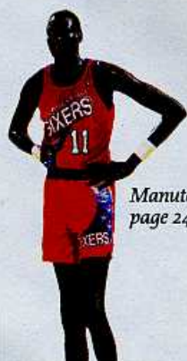
Manute Bol, page 24

25 | VIEWPOINT Romesh Ratnesar on Obama's need to adjust U.S. foreign policy for a less heroic age