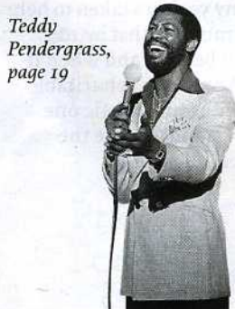
Teddy Pendergrass, page 19