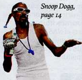
Snoop Dogg, page 14