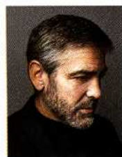
Frequent flyer George Clooney in Up in the Air , page 119