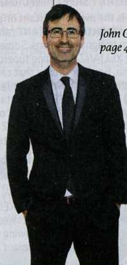
John Oliver, page 46