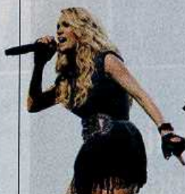
Underwood, page 56

60 | 9 Questions with former Nightline anchor Ted Koppel