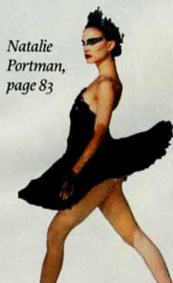
Natalie Portman, page 83

92 | ESSAY Nancy Gibbs on Sarah Palin's restoration rhetoric