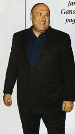
James Gandolfini, page 52

Novelist and National Book Award winner Louise Erdrich