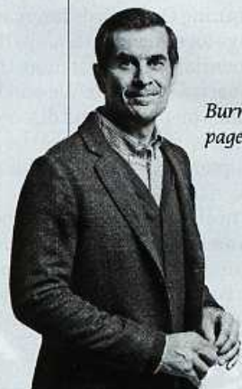
Burrell, page 64

TIME (ISSN 0040-781X) is published weekly, except for two issues combined at year-end, by Time Inc. Principal Office: Time & Life Building, Rockefeller Center, New York, NY 10020-1393. Periodicals postage paid at New York, N.Y., and at additional mailing offices. Canada Post Publications Mail Agreement No. 40110178. Return undeliverable Canada addresses to: Postal Str. A, P.O. Box 4322, Toronto, Ont., M5W 3G9. GST #R88381621RT0001. © 2012 Time Inc. All rights reserved. Reproduction in whole or in part without written permission is prohibited. TIME and the Red Border Design are protected through trademark registration in the United States and in the foreign countries where TIME magazine circulates. U.S. subscriptions: $49 for one year. Subscribers: If the Postal Service alerts us that your magazine is undeliverable, we have no further obligation unless we receive a corrected address within two years. Postmaster: Send address changes to P.O. Box 62120, Tampa, FL 33662-2120. CUSTOMER SERVICE AND SUBSCRIPTIONS—For 24/7 service, please use our website: www.time.com/customerservice . You can also call 1-800-843-TIME or write to TIME, P.O. Box 62120, Tampa, FL 33662-2120. Mailing list: We make a portion of our mailing list available to reputable firms. If you would prefer that we not include your name, please call, or write us at P.O. Box 62120, Tampa, FL 33662-2120, or send us an e-mail at privacy@time.customerservice.com . Printed in the U.S.