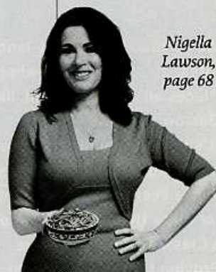
Nigella Lawson, page 68

TIME (ISSN 0040-781X) is published weekly, except for two issues combined for one week in January, May, July and August, by Time Inc. Principal Office: Time & Life Building, Rockefeller Center, New York, NY 10020-1393. Periodicals postage paid at New York, N.Y., and at additional mailing offices. Canada Post Publications Mail Agreement No. 40130178. Return undeliverable Canada addresses to: Postal Stn A, P.O. Box 4322, Toronto, Ont., M5W 3G9. GST #R68381621R0001 © 2013 Time Inc. All rights reserved. Reproduction in whole or in part without written permission is prohibited. TIME and the Red Border Design are protected through trademark registration in the United States and in the foreign countries where TIME magazine circulates. U.S. subscriptions: $49 for one year. Subscribers: If the Postal Service alerts us that your magazine is undeliverable, we have no further obligation unless we receive a corrected address within two years. Postmaster: Send address changes to P.O. Box 62120, Tampa, FL 33662-2120. CUSTOMER SERVICE AND SUBSCRIPTIONS—For 24/7 service, please use our website: www.time.com/customerservice . You can also call 1-800-843-TIME or write to TIME, P.O. Box 62120, Tampa, FL 33662-2120. Mailing list: We make a portion of our mailing list available to reputable firms. If you would prefer that we not include your name, please call, or write us at P.O. Box 62120, Tampa, FL 33662-2120, or send us an e-mail at privacy@time.customersvc.com . Printed in the U.S.