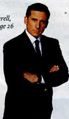
Carell, page 26

27 | MILESTONE Farewell to Senator Robert Byrd