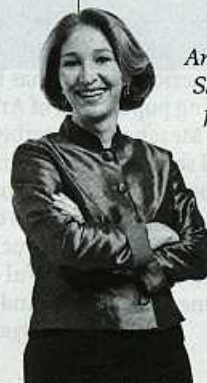
Anne-Marie Slaughter, page 64

Anne-Marie Slaughter, former director of policy planning for the U.S. State Department