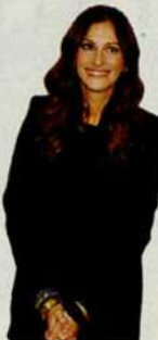
Julia Roberts, page 55

53 | GOING GREEN Partial vegetarians: eating their veggies—and bacon too!