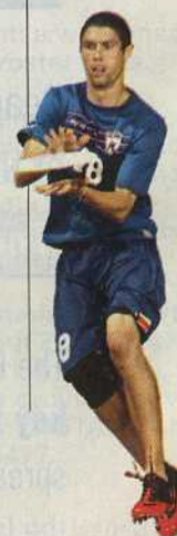
Disc jockey, page 64

TIME (ISSN 0040-781X) is published weekly, except for two issues combined for one week in January, May, July and August, by Time Inc. Principal Office: Time & Life Building, Rockefeller Center, New York, NY 10020-1393. Periodicals postage paid at New York, N.Y., and at additional mailing offices. Canada Post Publications Mail Agreement No. 40110178. Return undeliverable Canada addresses to: Postal Stn A, P.O. Box 4322, Toronto, Ont., M5W 3G9. GST #888381621RT0001. © 2013 Time Inc. All rights reserved. Reproduction in whole or in part without written permission is prohibited. TIME and the Red Border Design are protected through trademark registration in the United States and in the foreign countries where TIME magazine circulates. U.S. subscriptions: $49 for one year. Subscribers: If the Postal Service alerts us that your magazine is undeliverable, we have no further obligation unless we receive a corrected address within two years. Postmaster: Send address changes to P.O. Box 62120, Tampa, FL 33662-2120. CUSTOMER SERVICE AND SUBSCRIPTIONS—For 24/7 service, please use our website: www.time.com/customerservice . You can also call 1-800-843-TIME or write to TIME, P.O. Box 62120, Tampa, FL 33662-2120. Mailing list: We make a portion of our mailing list available to reputable firms. If you would prefer that we not include your name, please call, or write us at P.O. Box 62120, Tampa, FL 33662-2120, or send us an e-mail at privacy@time.customersvc.com . Printed in the U.S.