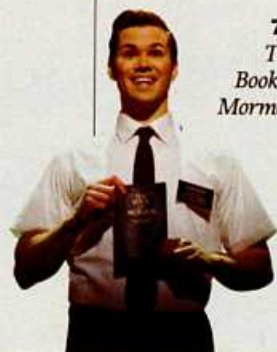
70 The Book of Mormon

TIME (ISSN 0040-781X) is published weekly, except for two issues combined at year-end, by Time Inc. Principal Office: Time & Life Building, Rockefeller Center, New York, NY 10020-1393. Periodicals postage paid at New York, N.Y., and at additional mailing offices. Canada Post Publications Mail Agreement No. 40110178. Return undeliverable Canada addresses to: Postal Stn A, P.O. Box 4322, Toronto, Ont., M5W 3G9, GST #122781974RT © 2011 Time Inc. All rights reserved. Reproduction in whole or in part without written permission is prohibited. TIME and the Red Border Design are protected through trademark registration in the United States and in the foreign countries where TIME magazine circulates. U.S. subscriptions: $49 for one year. Subscribers: If the Postal Service alerts us that your magazine is undeliverable, we have no further obligation unless we receive a corrected address within two years. Postmaster: Send address changes to TIME, P.O. Box 30601, Tampa, FL 33630-0601. CUSTOMER SERVICE AND SUBSCRIPTIONS—For 24/7 service, please use our website: www.time.com/customer-service . You can also call 1-800-843-TIME or write to TIME at P.O. Box 30601, Tampa, FL 33630-0601. Mailing list: We make a portion of our mailing list available to reputable firms. If you would prefer that we not include your name, please call, or write us at P.O. Box 50001, Tampa, FL 33630, or send us an e-mail at privacy@time.customersvc.com . Printed in the U.S.