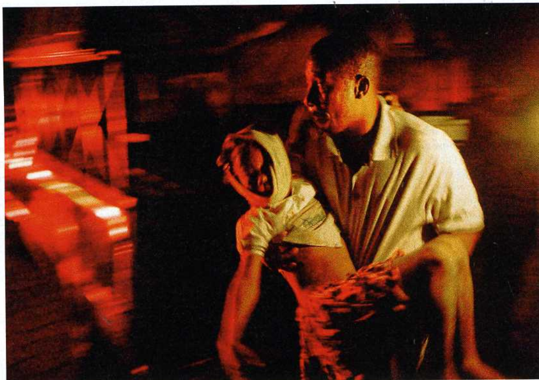
Caribbean nightmare A 7.0-magnitude earthquake leaves Haiti in a state of desperation