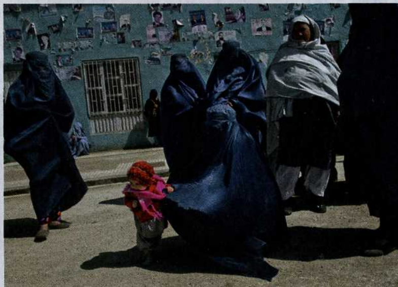
Afghan women leave a rally for presidential hopeful Zalmay Rassoul on March 27. Elections begin April 5.