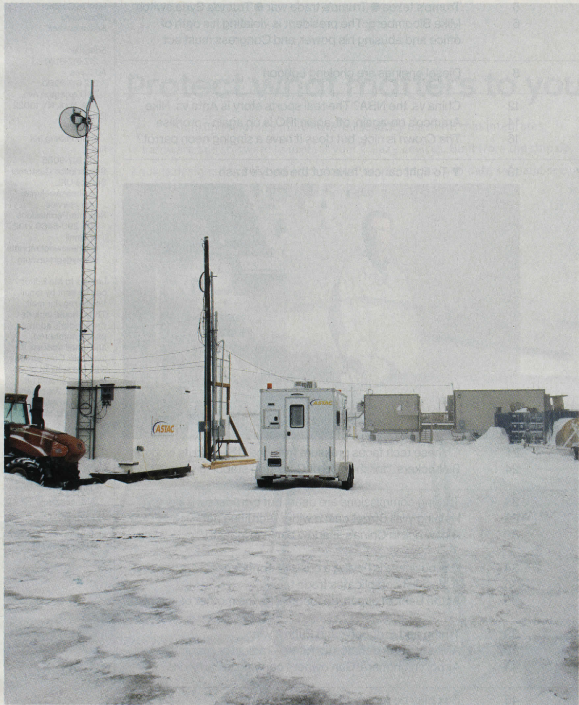
◀ Where Quintillion's fiber-optic cable comes above ground, near Utqiagvik, Alaska