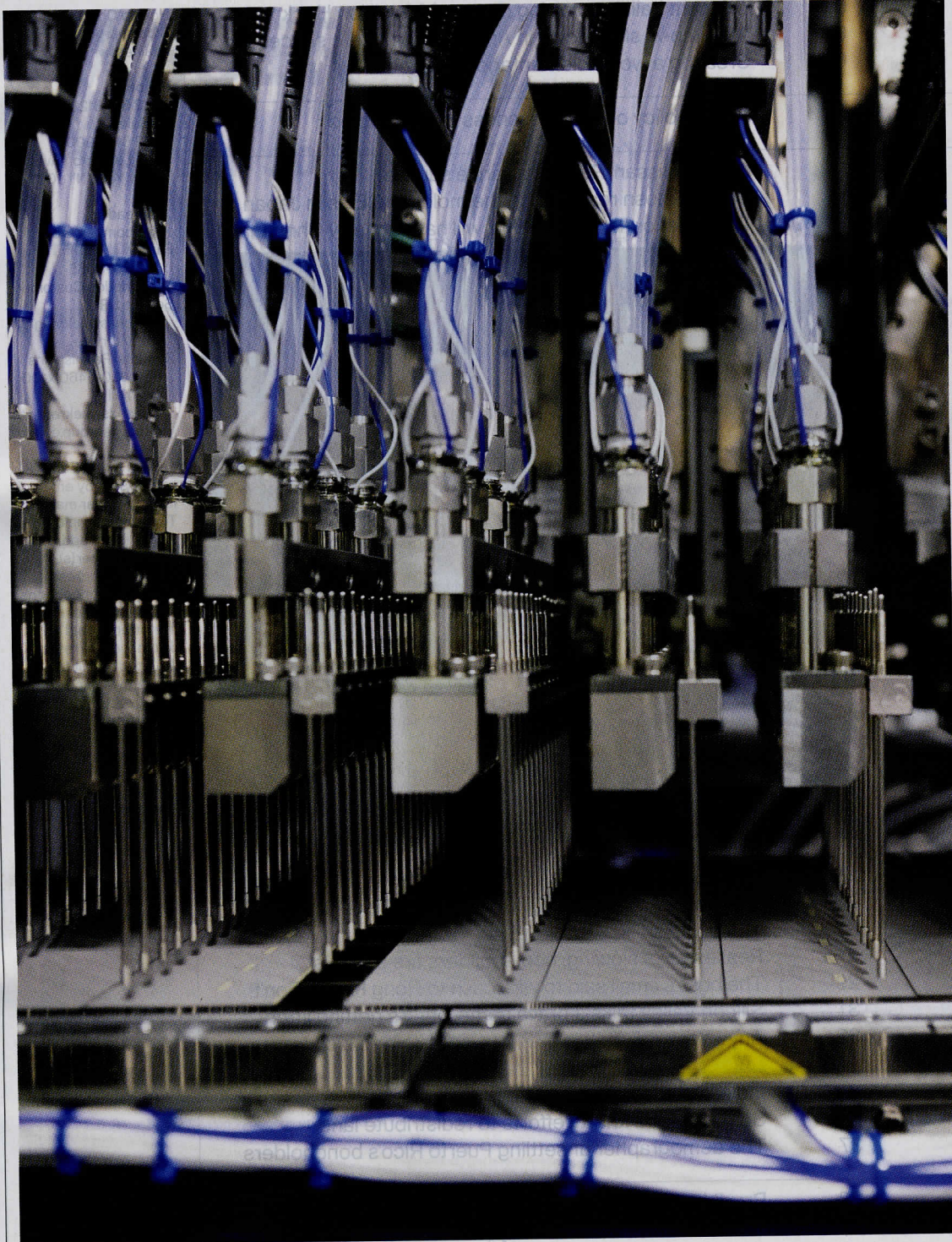
◀ Inside Buffalo's Tesla Gigafactory 2