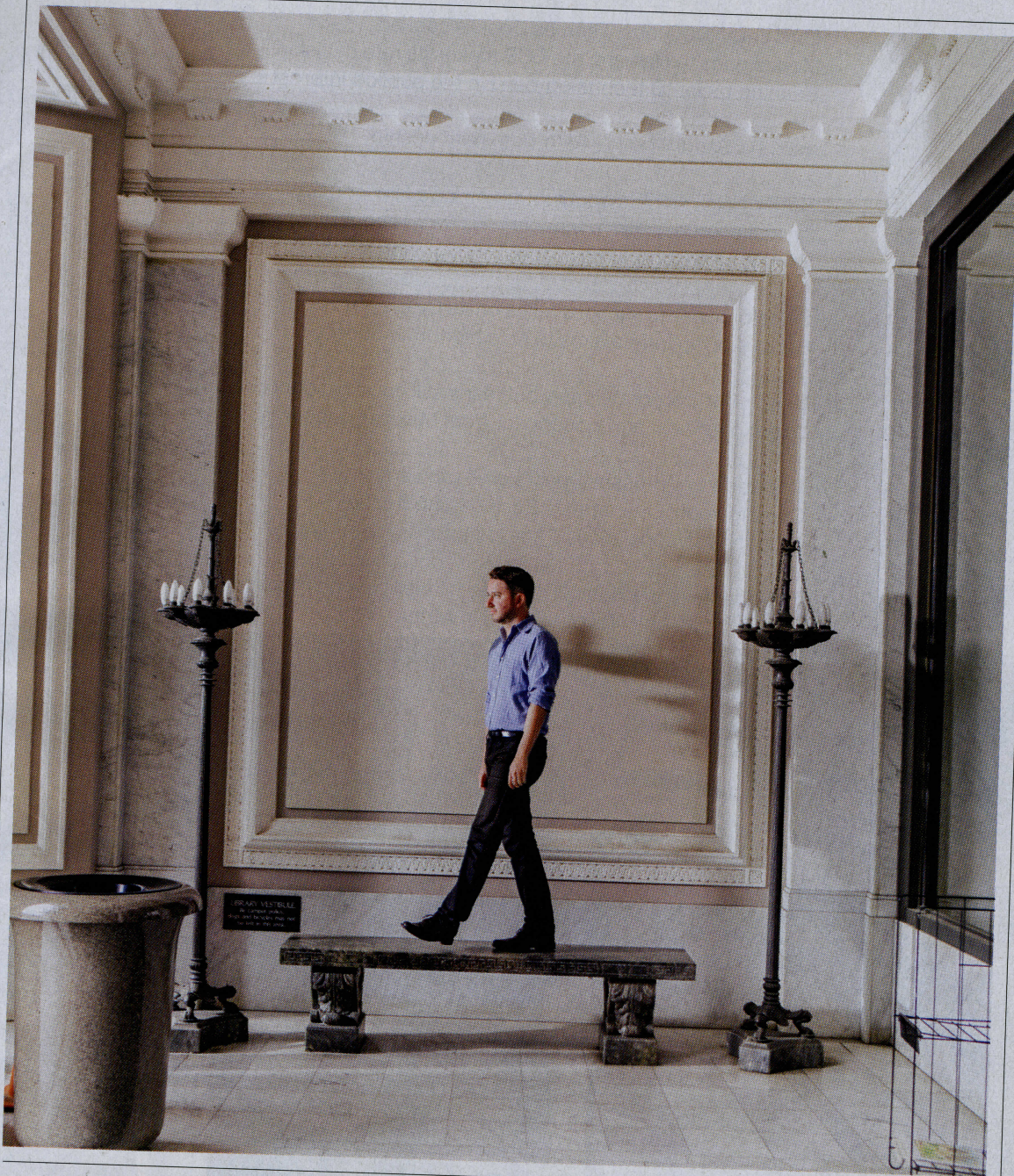
◀ Gabriel Zucman at UC Berkeley, where the economist pores through data to uncover the secret wealth of the super rich