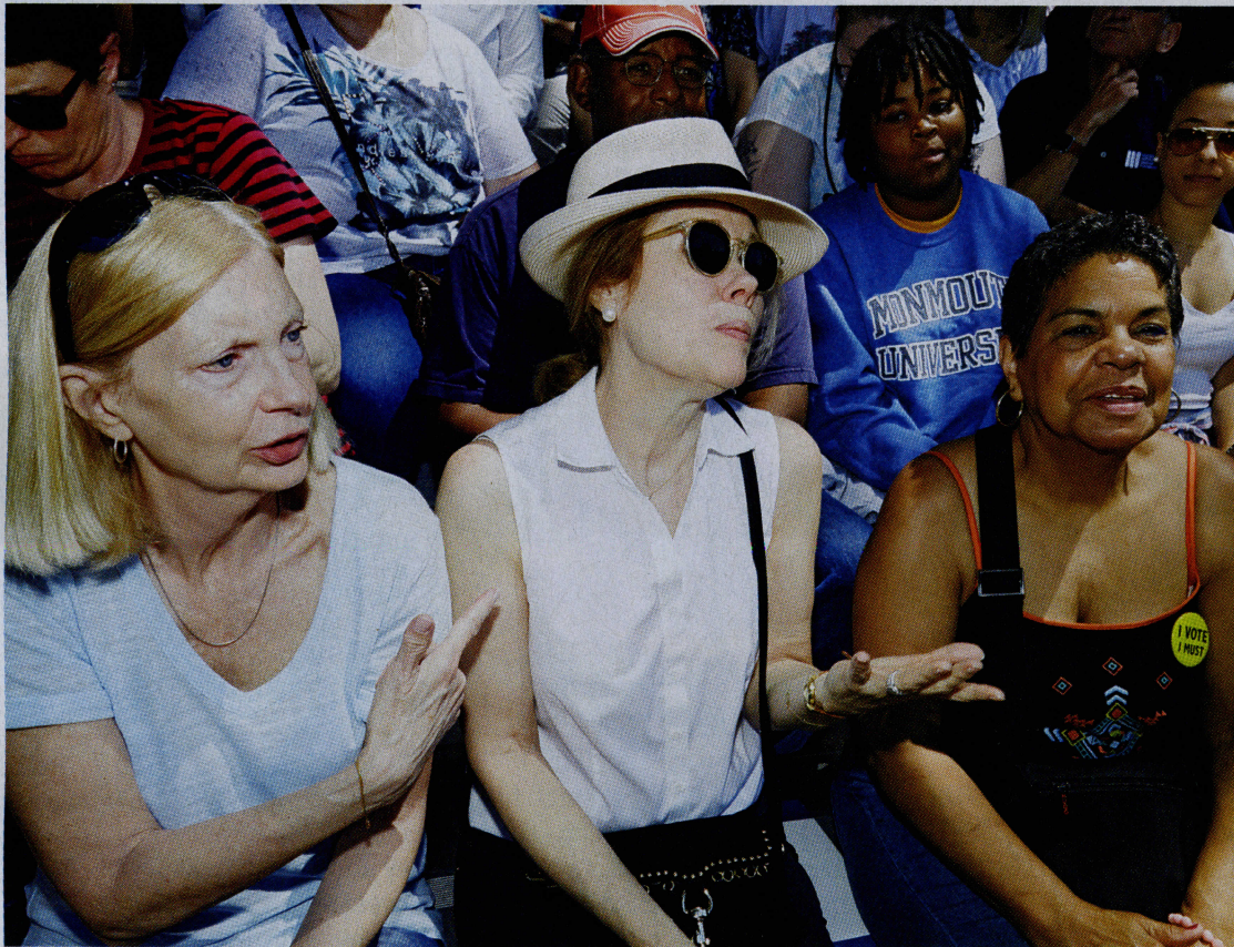
43 ▲ The Long Campaign: Biden bets that voters want unity

Facebook facebook.com/ bloomberg businessweek/ Twitter @BW Instagram @businessweek