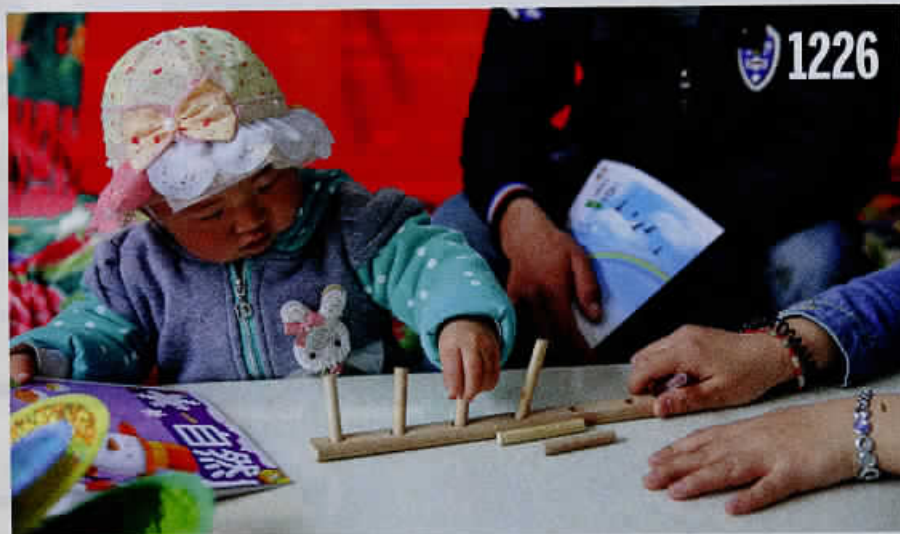
Tests highlight a parenting deficit in rural China.

22 SEPTEMBER 2017 • VOLUME 357 • ISSUE 6357