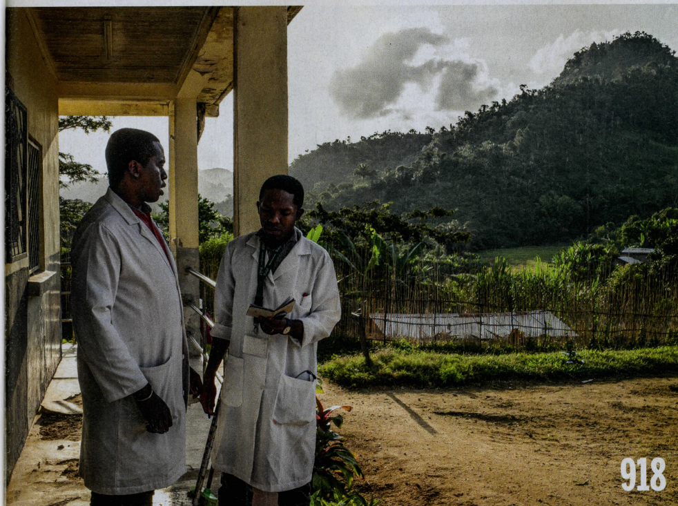
A hospital in Ifanadiana in Madagascar is one focus of an effort to improve the country's health infrastructure.