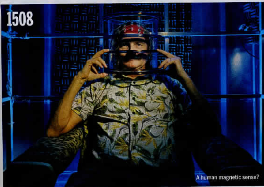
A human magnetic sense?