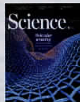
Illustration of woven molecular fabric. Interlacing threads to create woven patterns is among the oldest methods of making fabric, but until now, this technique has not

been duplicated in complex chemical structures. Liu et al. used threads made from organic molecules linked together by strong covalent bonds to weave a three-dimensional covalent organic framework with unusual dynamical and mechanical properties. This molecular weaving method will enable the production of materials with increased precision and functionality. See pages 336 and 365. Illustration: C. Bickel/Science