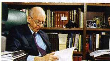
Richard Posner has had a change of heart