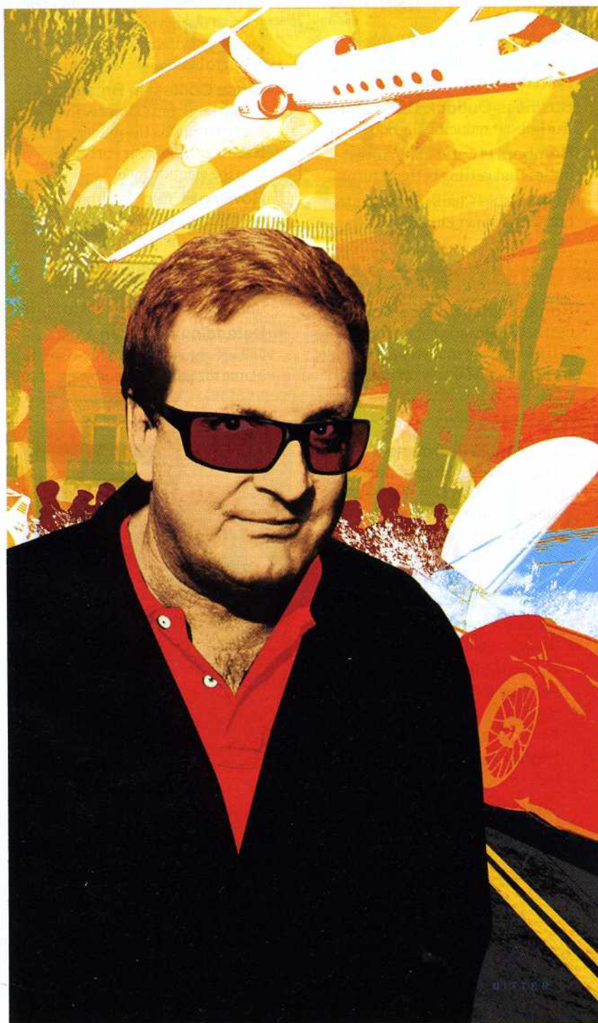
PHOTO ILLUSTRATION BY JOHN RITTER; PHOTOGRAPH BY A SCOTT/PATRICKMcMULLAN