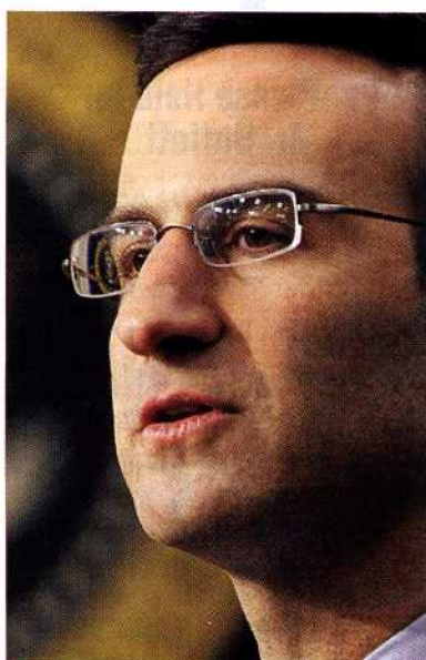
OMB chief Peter Orszag