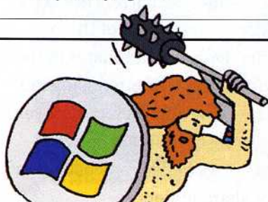
Browsers wars: the sequel