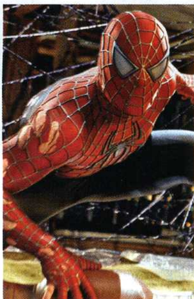
Spider-Man 3: Headed for a PC near you