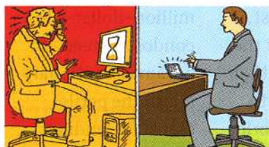
How to get closer to "instant-on" PCs