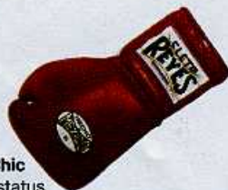
Puglist Chic Bloody noses as a status symbol in Russia p69