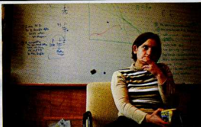
Economist Esther Duflo A radical new approach to emerging nations