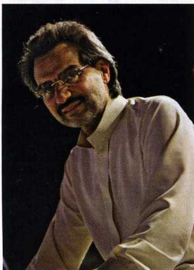
Prince Alwaleed: A bank tax is "premature"