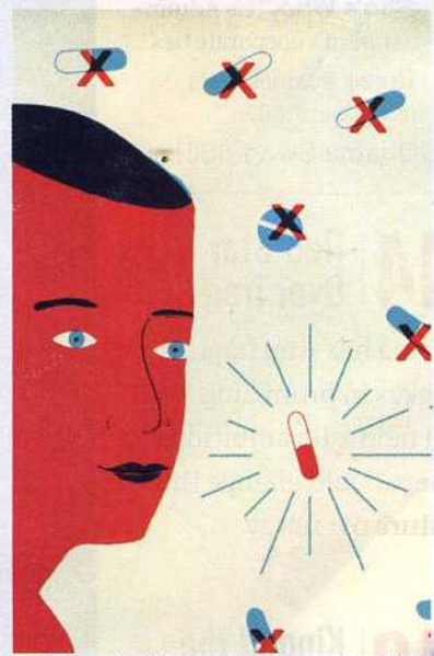
Finding the right treatment for each patient