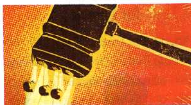
Jack Bogle has a suggestion for investors