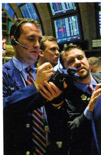
Who says the U.S. stock rally is over?