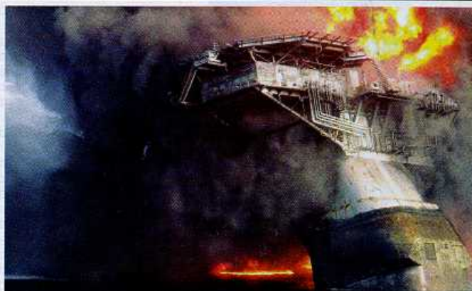
Engulfed The Deepwater Horizon rig burns off the Louisiana coast