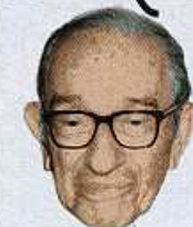
Alan Greenspan p64