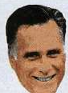
Mitt Romney p60