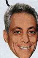
Rahm Emanuel p85