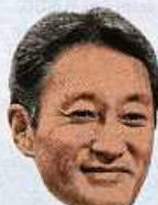
Kazuo Hirai p98