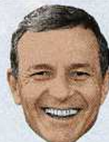
Bob Iger p82