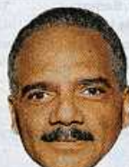
Eric Holder p80