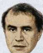
Nouriel Roubini p92