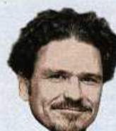
Dave Eggers p70