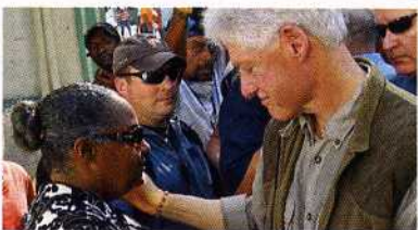
Clinton: How business can help in Haiti