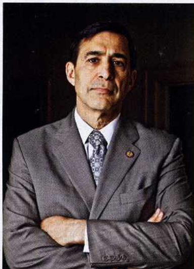
Issa isn't your starched-collar Republican