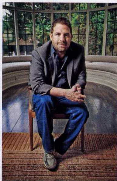
▲ Brand-minded filmmaker Brett Ratner