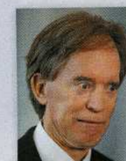
"Oh, the humanity. But we have to remember this is a story about bond management."