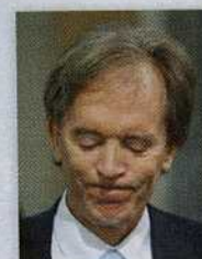
"Perplexed, confused, unwound, uncertain ... unusable."