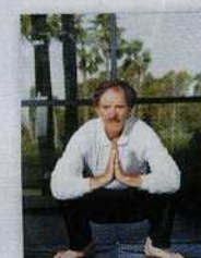
"This picture will never leave me. It's seared itself into my retinas. Everywhere I look, all I see is a squatting fund manager."