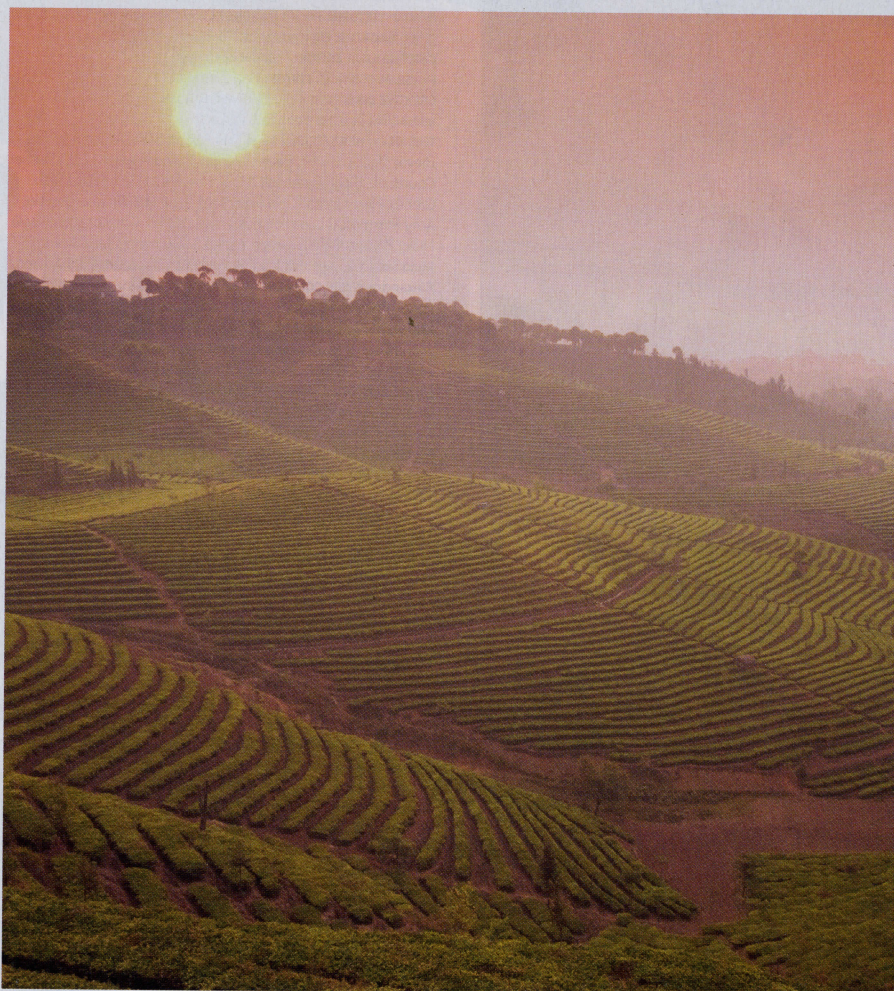
The largest tea plantation in the province of Yunnan, China, is a source of pu-erh, a prized tea.

Green tea's potential as a treatment for cancer